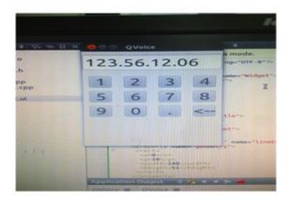
Fig 2: Dial Pad IP Generation

Once this application is developed then next term is to installed this application to development board generally in OS manufacture are installed his own file so to removed this application file in kernel then put the Qt dial Project in to application. Hence maximum free source date used and try to implement low cost VoIP application project.